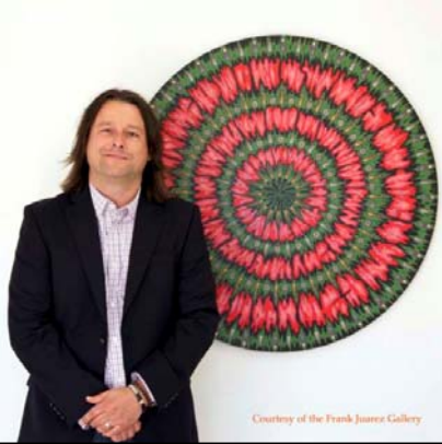
Courtesy of the Frank Janner Gallery